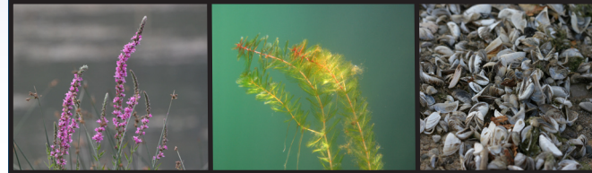
Purple Loosestrife Lythrum salicaria